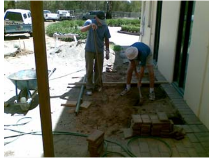
The last few pavers go in

Building work is now finally complete. Council's final inspection took place on Thursday 28 th January and a Certificate of Completion granted – shed is now fully operational. Well done to all concerned with this fantastic achievement.