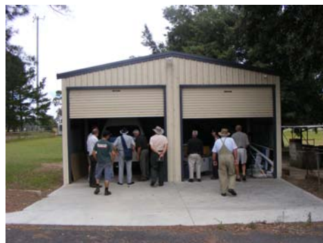
Can we fit a few more people in?