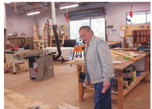
The well laid out Bridgetown workshop.