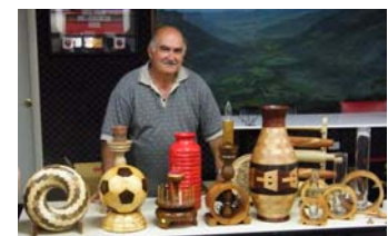
Wood Turner's display at Oakdale 2009

Why not come and join in and learn what is happening in your shire?